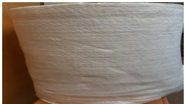
Fire Barrier Roll