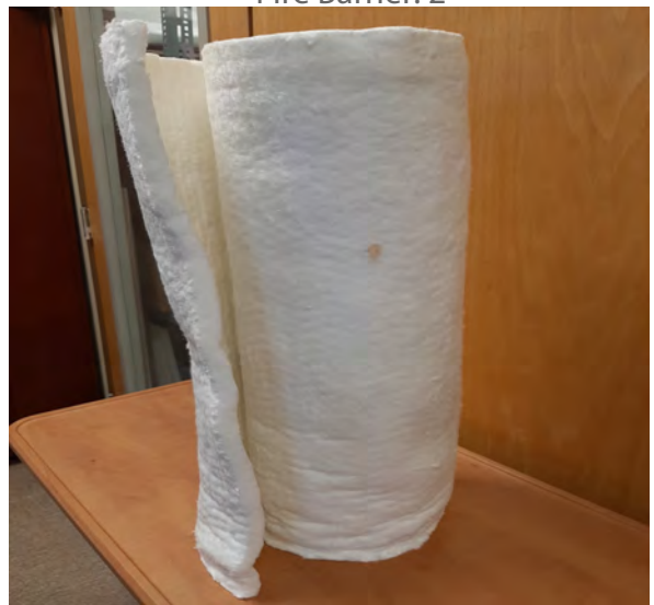
Fire Barrier: 1/2"